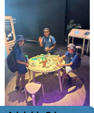
Port Noarlunga Aquatics