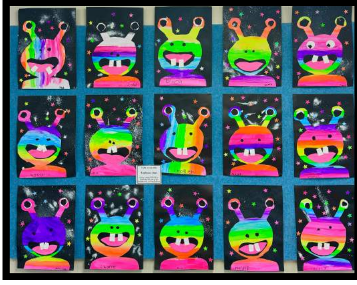
Art at Bordertown Primary School