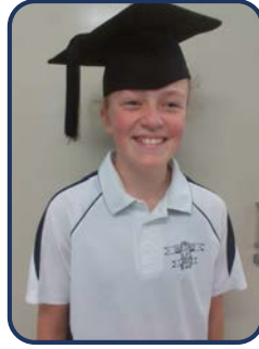
Grace COVID lockdown in 2020