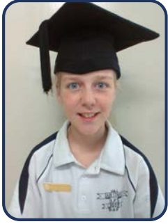
Emmy The google meet when I became house captain