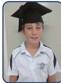
Brodie Friends and when the French room caught on fire