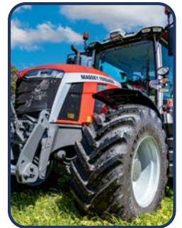
Will When the French room caught on fire