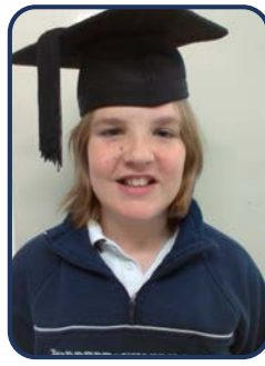
Dylan Primary school itself, I will never forget it