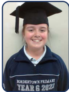
Summer First day at Bordertown when everyone was supportive and friendly