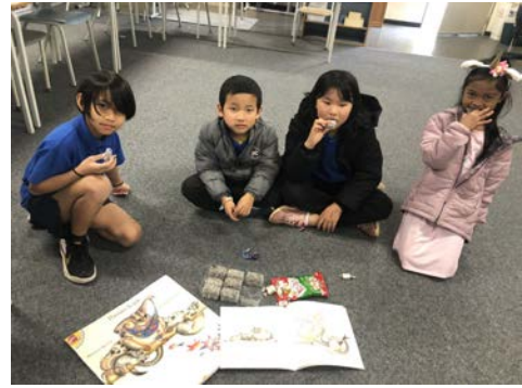
Indulging in lamingtons and Minties while reading 'Possum Magic'