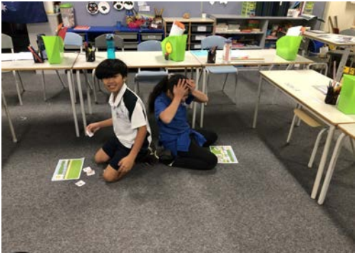
Barrier games to develop speaking and listening skills