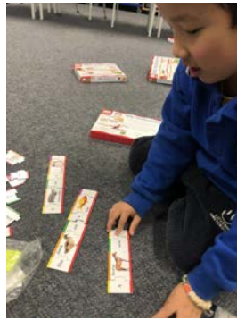
Focusing on sentence structure